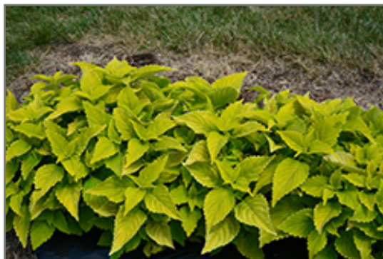
ColorBlaze Lime Time Coleus