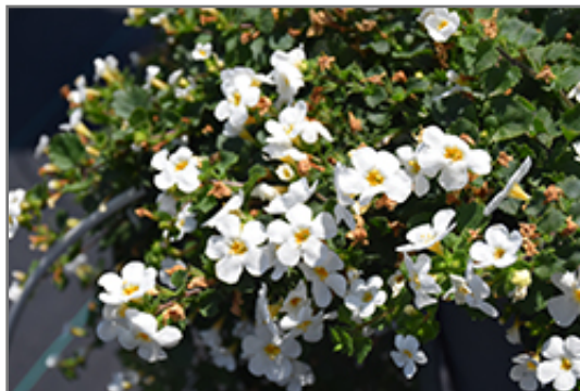
Snowstorm Snow Globe Bacopa flowers