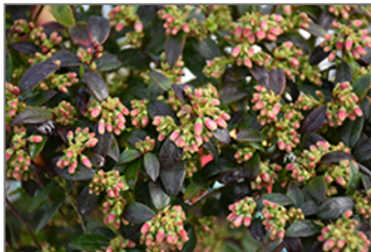
Blueberry Glaze Blueberry flowers

This is a multi-stemmed deciduous shrub with a mounded form. Its average texture blends into the landscape, but can be balanced by one or two finer or coarser trees or shrubs for an effective composition. This is a relatively low maintenance plant, and usually looks its best without pruning, although it will tolerate pruning. It is a good choice for attracting birds to your yard. It has no significant negative characteristics.