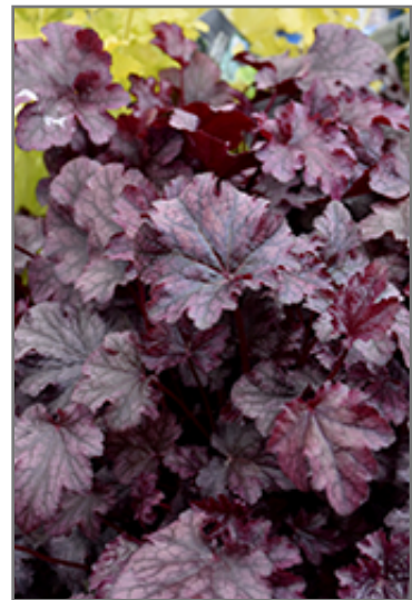
Plum Pudding Coral Bells foliage

Plum Pudding Coral Bells is recommended for the following landscape applications;