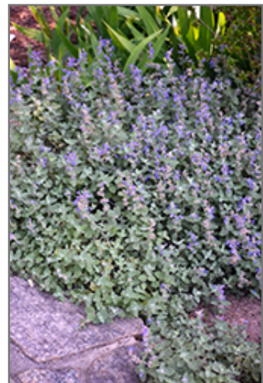
Early Bird Catmint in bloom