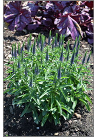
Magic Show Wizard of Ahhs Speedwell in bloom

Magic Show Wizard of Ahhs Speedwell is a fine choice for the garden, but it is also a good selection for planting in outdoor pots and containers. It is often used as a 'filler' in the 'spiller-thriller-filler' container combination, providing a mass of flowers against which the larger thriller plants stand out. Note that when growing plants in outdoor containers and baskets, they may require more frequent waterings than they would in the yard or garden.