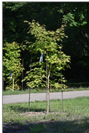
Jack Frost Arctic Jade Maple