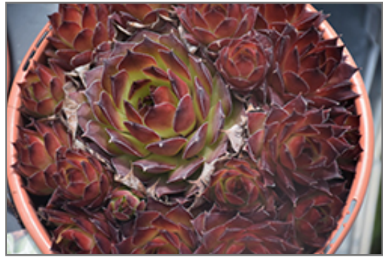
Black Hens And Chicks

Black Hens And Chicks is a fine choice for the garden, but it is also a good selection for planting in outdoor pots and containers. It is often used as a 'filler' in the 'spiller-thriller-filler' container combination, providing a canvas of foliage against which the larger thriller plants stand out. Note that when growing plants in outdoor containers and baskets, they may require more frequent waterings than they would in the yard or garden.