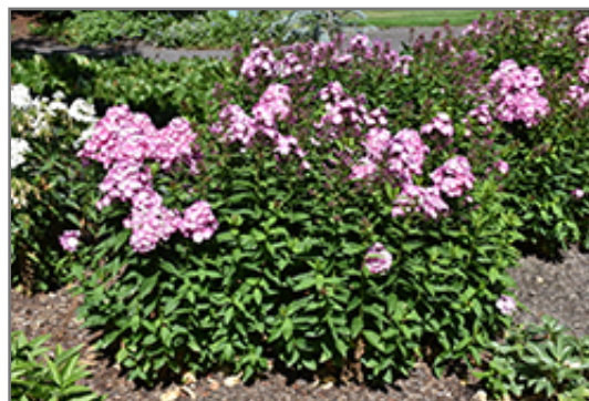
Volcano Pink with White Eye Garden Phlox in bloom