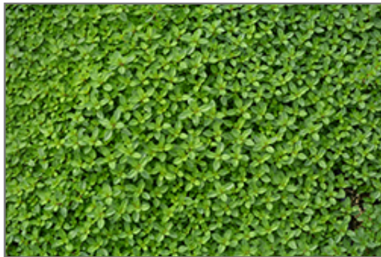
Creeping Thyme foliage