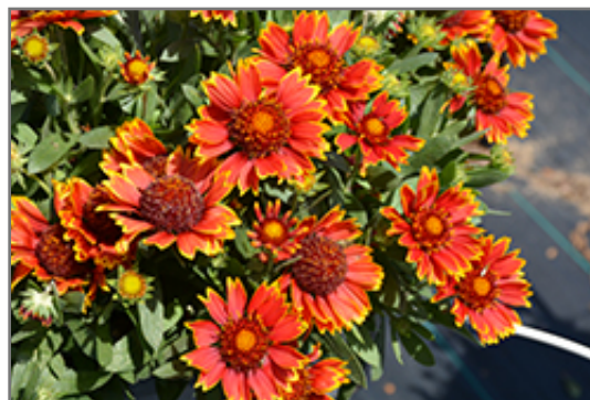
SpinTop Orange Halo Blanket Flower flowers