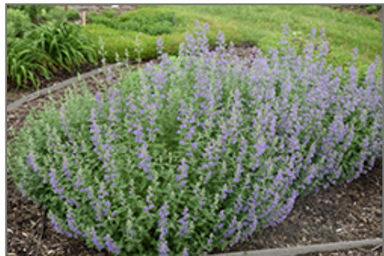
Walker's Low Catmint in bloom