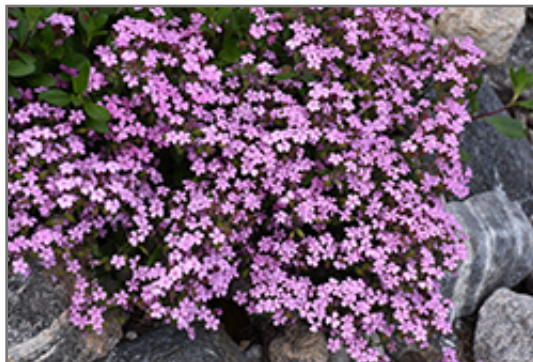
Rock Soapwort in bloom