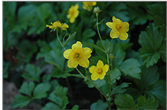
Barren Strawberry flowers