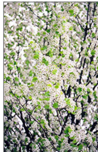
Bradford Ornamental Pear flowers