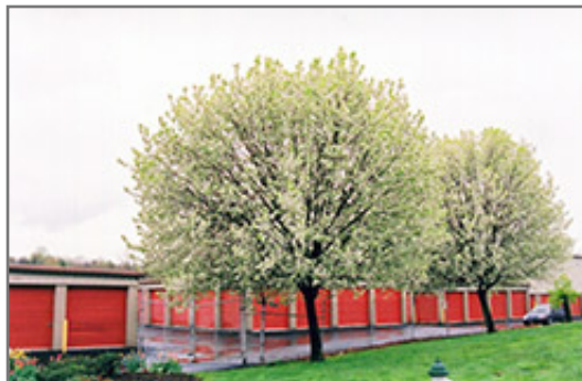
Bradford Ornamental Pear in bloom

Bradford Ornamental Pear is recommended for the following landscape applications;