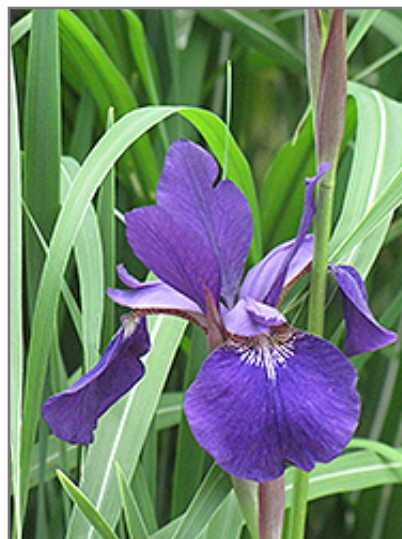
Caesar's Brother Siberian Iris flowers