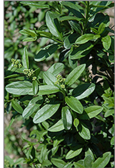
California Privet foliage