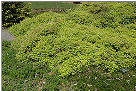
Golden Elf Spirea

Golden Elf Spirea is recommended for the following landscape applications;