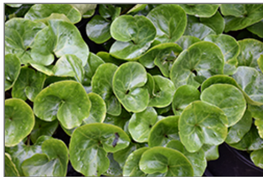
European Wild Ginger foliage