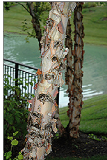
River Birch bark