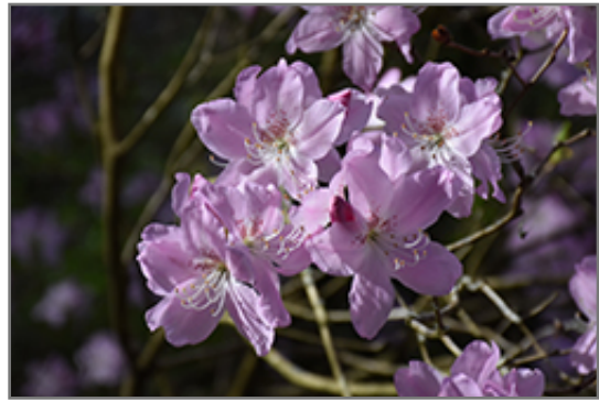
Royal Azalea flowers