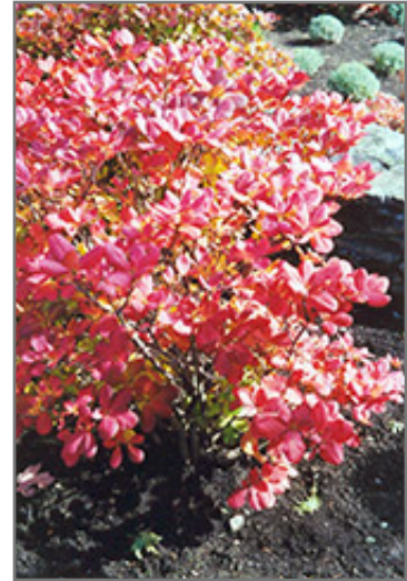
Royal Azalea in fall

* This is a 'special order' plant - contact store for details