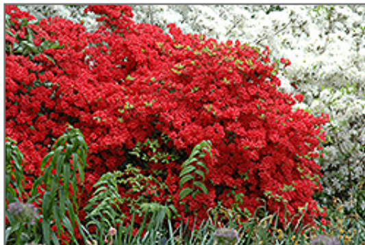
Stewartstonian Azalea in bloom