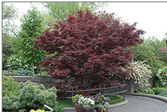
Bloodgood Japanese Maple