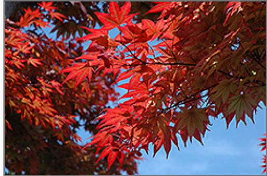
Oshio Beni Japanese Maple foliage

This tree does best in full sun to partial shade. You may want to keep it away from hot, dry locations that receive direct afternoon sun or which get reflected sunlight, such as against the south side of a white wall. It prefers to grow in average to moist conditions, and shouldn't be allowed to dry out. It is not particular as to soil pH, but grows best in rich soils. It is somewhat tolerant of urban pollution, and will benefit from being planted in a relatively sheltered location. Consider applying a thick mulch around the root zone in winter to protect it in exposed locations or colder microclimates. This is a selected variety of a species not originally from North America.