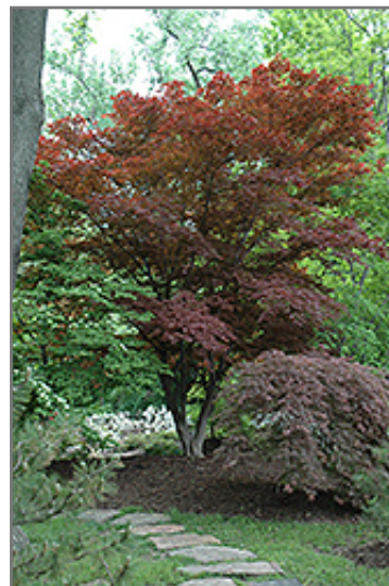
Oshio Beni Japanese Maple