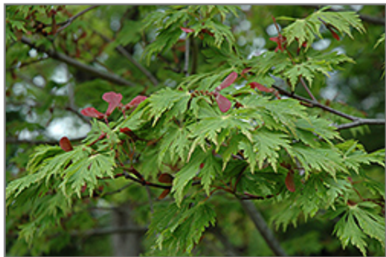
Maiku Jaku Fernleaf Full Moon Maple foliage