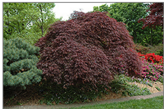
Red Select Cutleaf Japanese Maple