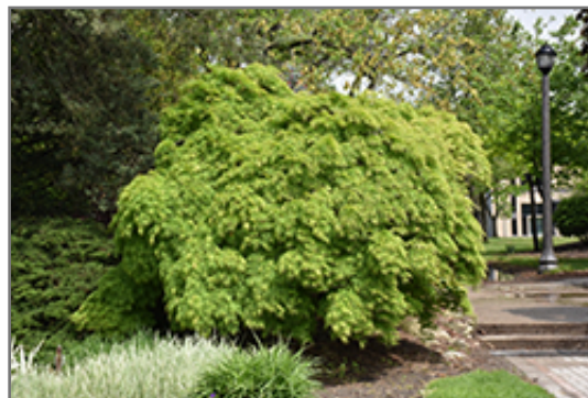
Cutleaf Japanese Maple