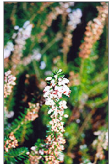
Scotch Heather flowers