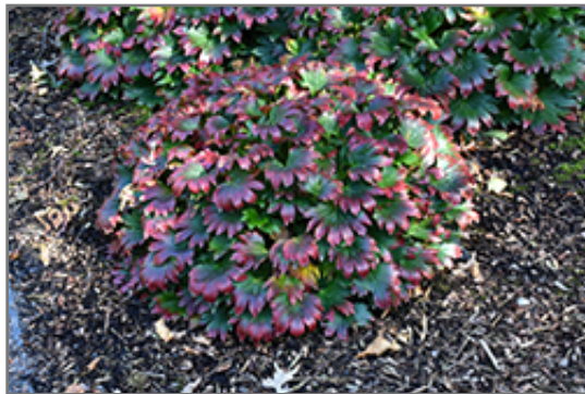
Crimson Fans Mukdenia