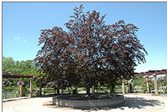
Purple Beech