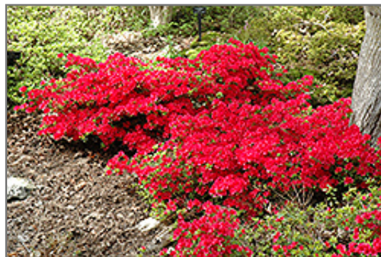
Hino Crimson Azalea in bloom