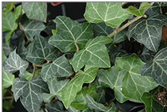
Baltic Ivy foliage