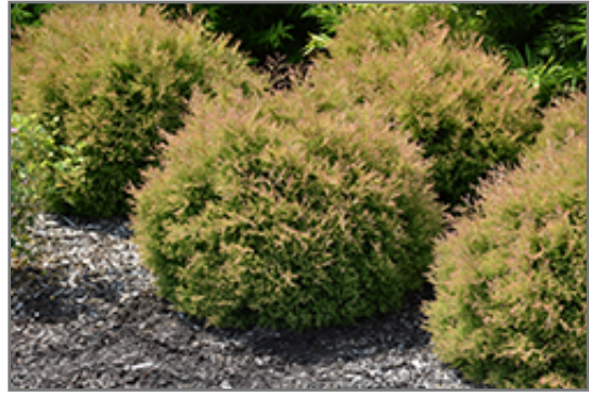
Fire Chief Arborvitae

Fire Chief Arborvitae will grow to be about 5 feet tall at maturity, with a spread of 5 feet. It tends to fill out right to the ground and therefore doesn't necessarily require facer plants in front, and is suitable for planting under power lines. It grows at a slow rate, and under ideal conditions can be expected to live for approximately 30 years.