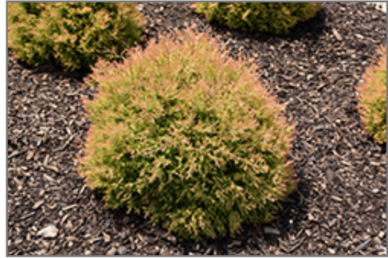
Fire Chief Arborvitae

Fire Chief Arborvitae is recommended for the following landscape applications;