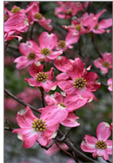
Cherokee Chief Flowering Dogwood flowers

This is a relatively low maintenance tree, and usually looks its best without pruning, although it will tolerate pruning. It is a good choice for attracting birds to your yard. Gardeners should be aware of the following characteristic(s) that may warrant special consideration;