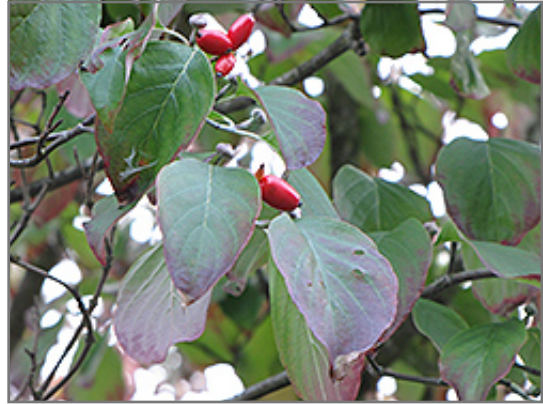
Cherokee Chief Flowering Dogwood fruit

* This is a 'special order' plant - contact store for details