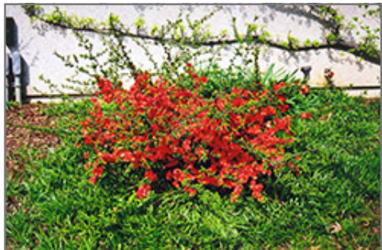
Common Flowering Quince in bloom

This is a high maintenance shrub that will require regular care and upkeep, and should only be pruned after flowering to avoid removing any of the current season's flowers. Gardeners should be aware of the following characteristic(s) that may warrant special consideration;