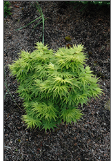
Mikawa Yatsubusa Japanese Maple

Mikawa Yatsubusa Japanese Maple is a fine choice for the yard, but it is also a good selection for planting in outdoor pots and containers. With its upright habit of growth, it is best suited for use as a 'thriller' in the 'spiller-thriller-filler' container combination; plant it near the center of the pot, surrounded by smaller plants and those that spill over the edges. It is even sizeable enough that it can be grown alone in a suitable container. Note that when grown in a container, it may not perform exactly as indicated on the tag - this is to be expected. Also note that when growing plants in outdoor containers and baskets, they may require more frequent waterings than they would in the yard or garden.