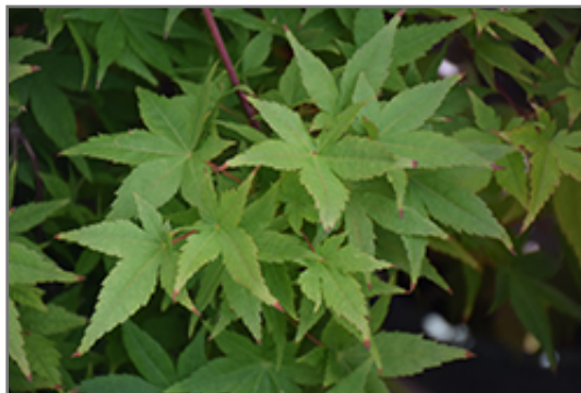
Ryusen Japanese Maple foliage