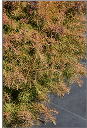
Mushroom Japanese Cedar foliage