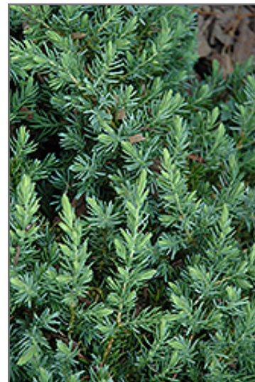
Blue Pacific Shore Juniper foliage