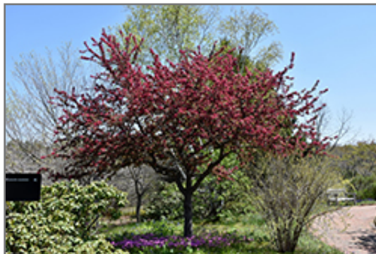
Adams Flowering Crab in bloom

Adams Flowering Crab is recommended for the following landscape applications;