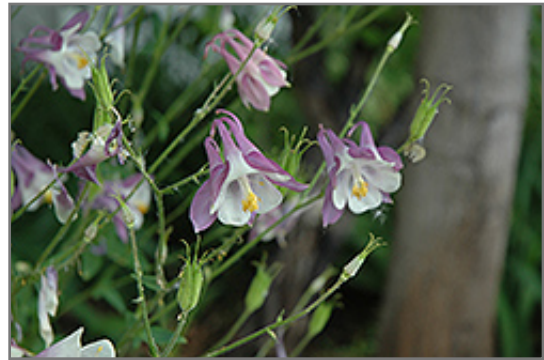
Common Columbine flowers