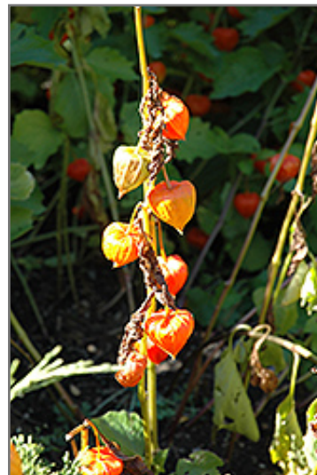
Chinese Lantern fruit