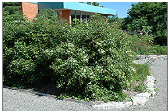
Gray Dogwood in bloom