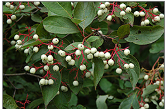
Gray Dogwood fruit