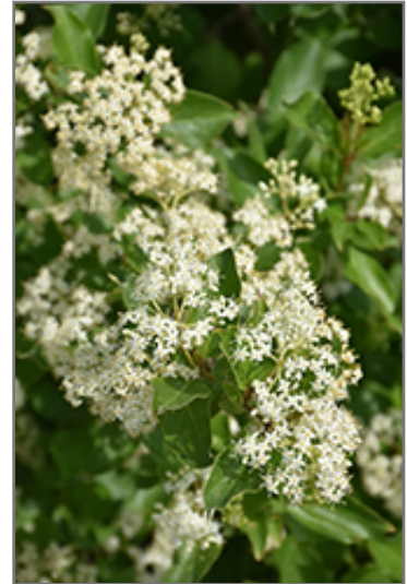
Gray Dogwood flowers

* This is a 'special order' plant - contact store for details