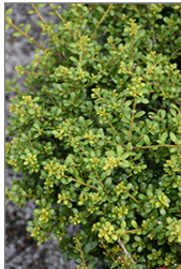
Schwoebel's Compact Japanese Holly foliage