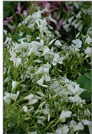
White Wood Sorrel in bloom

Rich clover-like bright green foliage, covered with dainty white trumpets in spring, lighting up the shaded areas of the garden; heavy spring bloom is followed by sporadic re-bloom all summer; morning sun to bright shade is fine