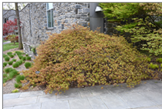
Spring Delight Japanese Maple