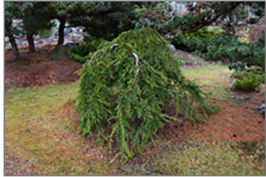
Repandens Deodar Cedar