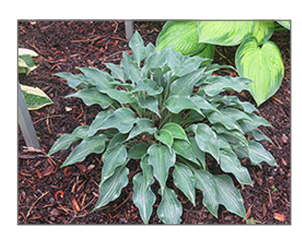
Rhythm And Blues Hosta