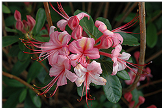
Pink And Sweet Azalea flowers

Pink And Sweet Azalea will grow to be about 4 feet tall at maturity, with a spread of 4 feet. It tends to be a little leggy, with a typical clearance of 1 foot from the ground. It grows at a slow rate, and under ideal conditions can be expected to live for 40 years or more.