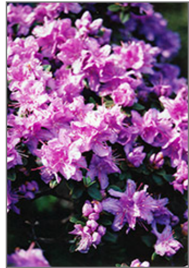
Ramapo Rhododendron flowers